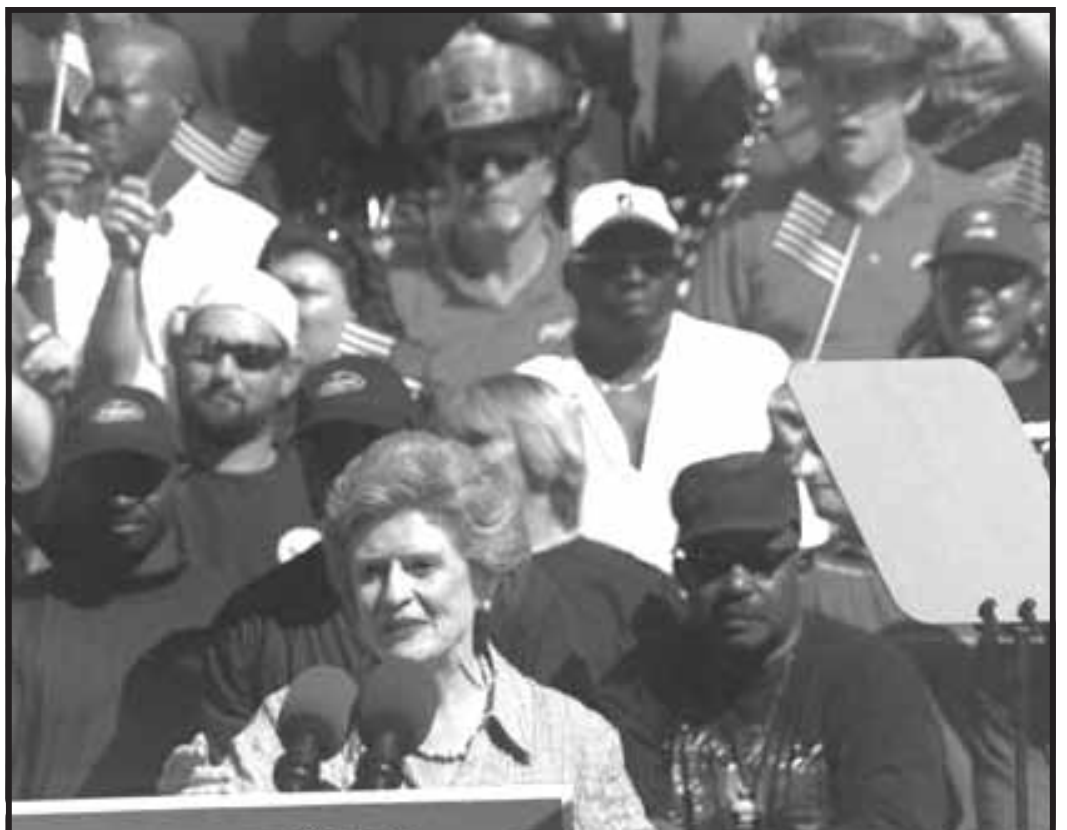
Senator Debbie Stabenow expressing support for the labor movement in Detroit on Labor Day.

For my part, I have no problem characterizing these corporate-centric super-PACs as treasonous. They are designed to subvert American democracy and turn our country over to the moneyed aristocracy. Their aspirations are apostasy to the notion of democratic governance that our Founders intended. We are now in a free fall toward old-fashioned oligarchy – that noxious, thieving, tyrannical, oppressive species of government that America’s original settlers fled Europe to escape . . .