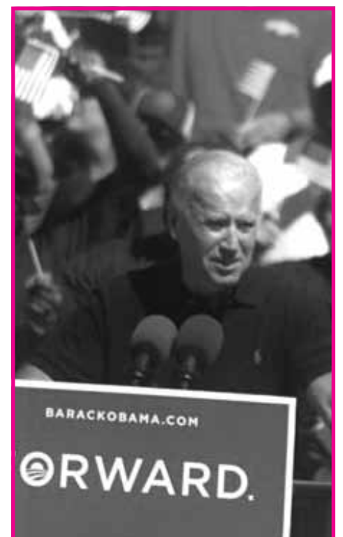
Vice President Joe Biden speaking in Detroit on Labor Day.