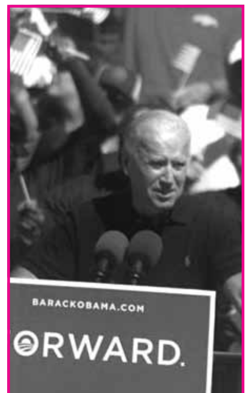
Vice President Joe Biden speaking in Detroit on Labor Day.