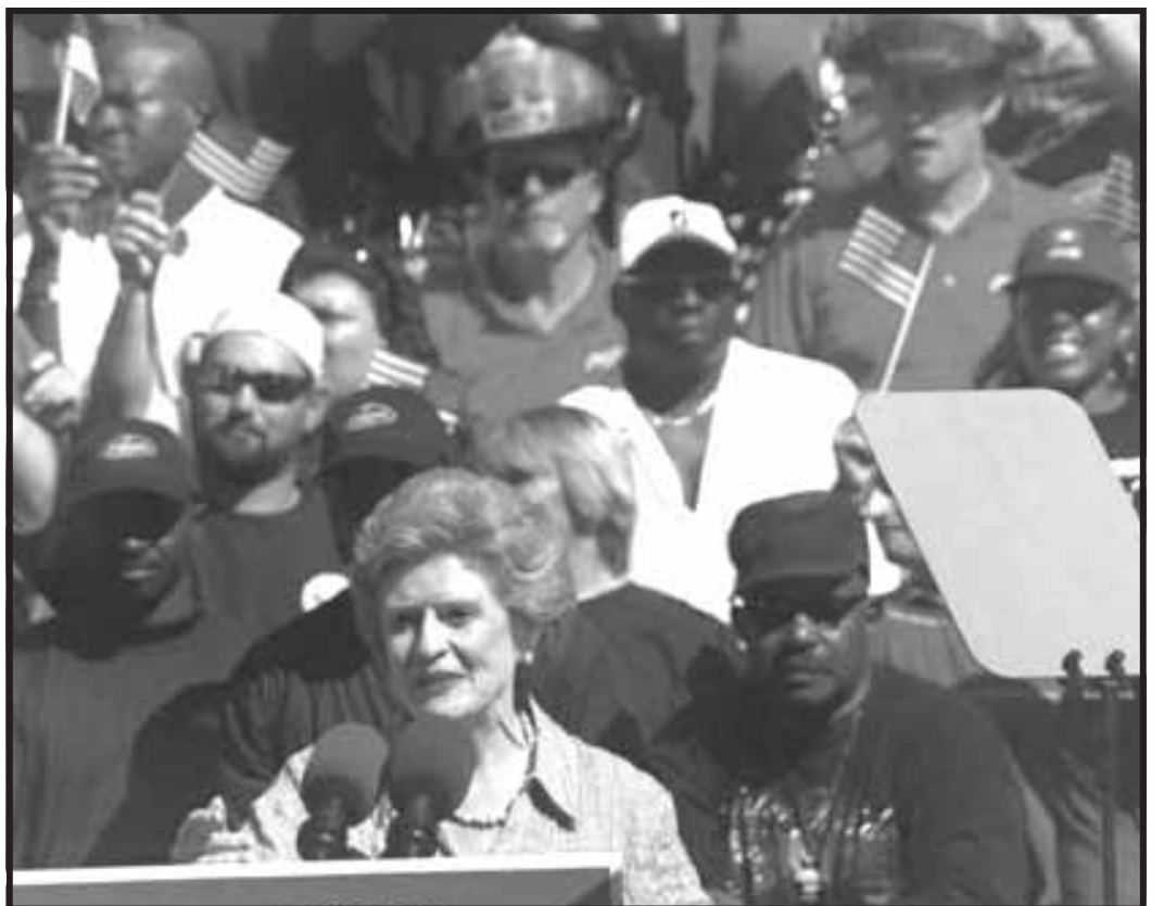
Senator Debbie Stabenow expressing support for the labor movement in Detroit on Labor Day.

For my part, I have no problem characterizing these corporate-centric super-PACs as treasonous. They are designed to subvert American democracy and turn our country over to the moneyed aristocracy. Their aspirations are apostasy to the notion of democratic governance that our Founders intended. We are now in a free fall toward old-fashioned oligarchy – that noxious, thieving, tyrannical, oppressive species of government that America’s original settlers fled Europe to escape . . .